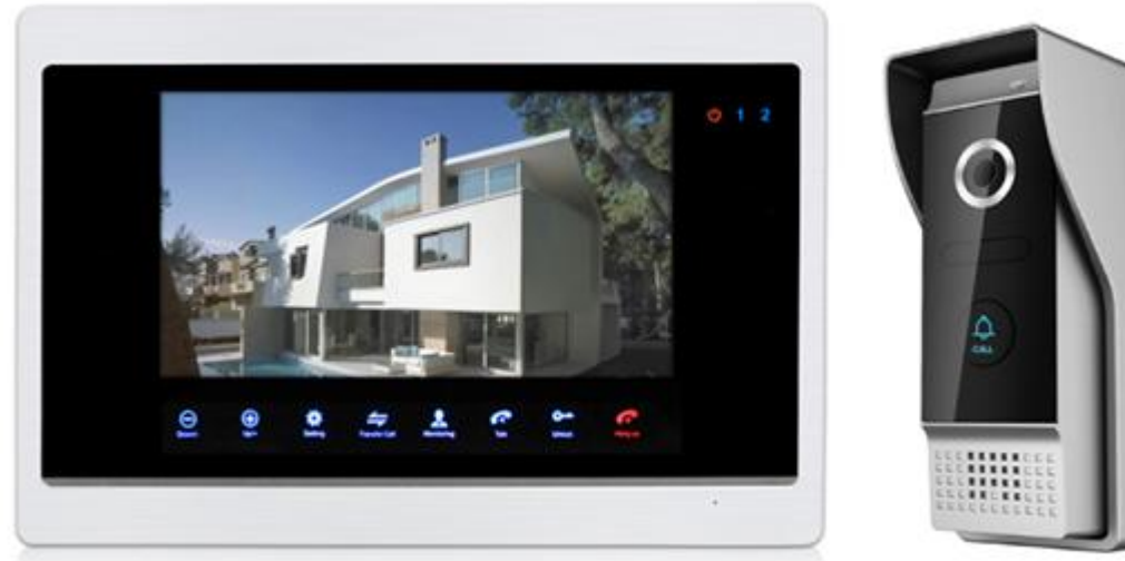
10" video intercom kit